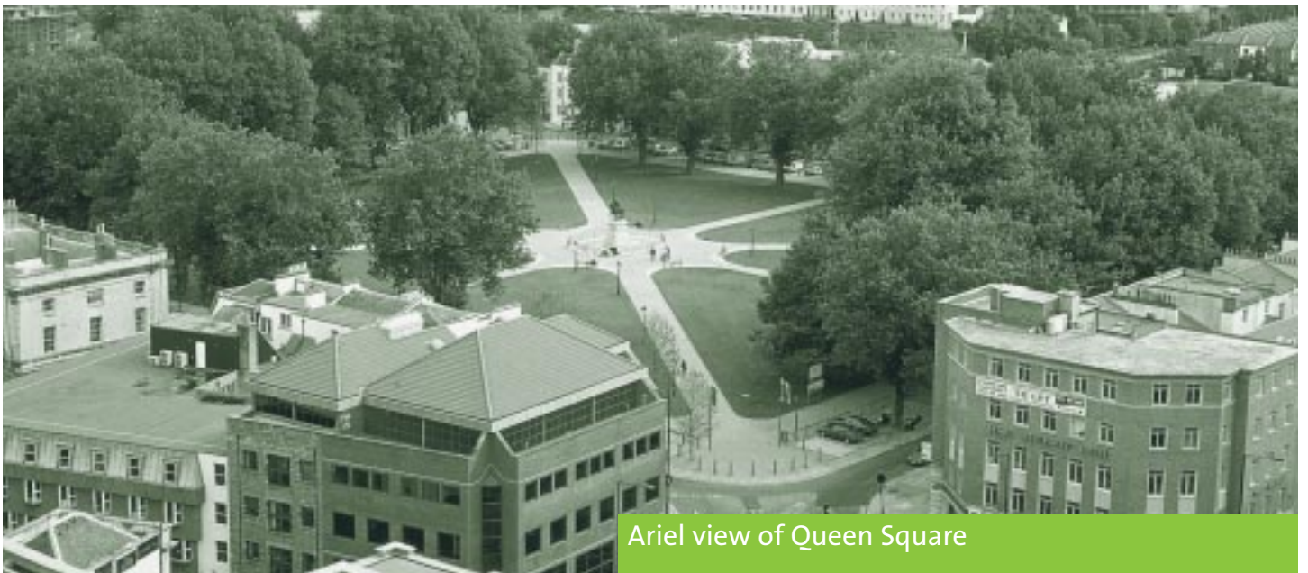
Ariel view of Queen Square