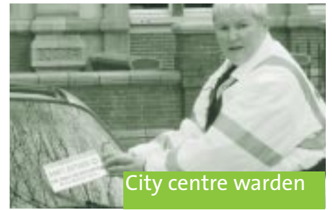
City centre warden

Adding to the already successful schemes in Easton and Eastville, the city centre